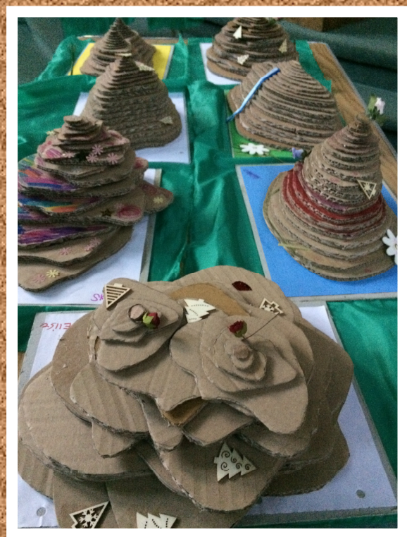
Some of the inventive mountain creations produced by our Quest children .

Want to see your photo here? Email it to the address on page 11