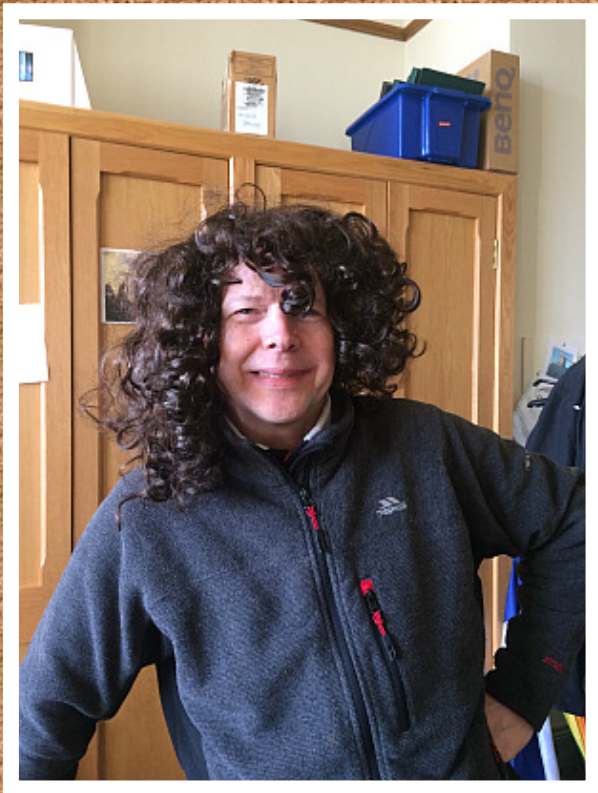
Even Sam can have a bad hair day...