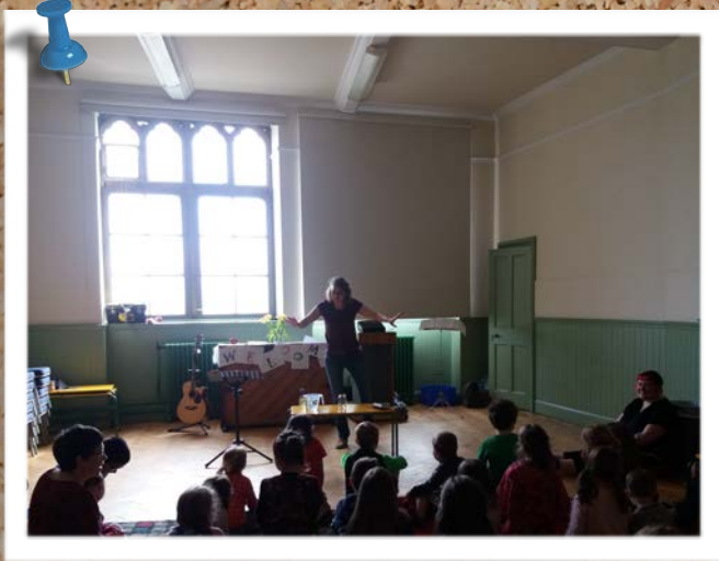
First ever kids service