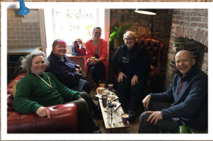
Staff retreat on Holy Island