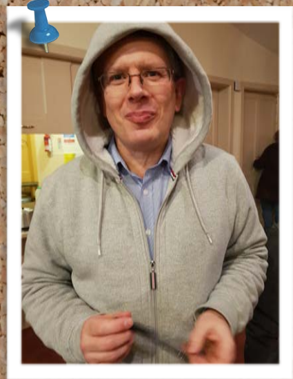
You know it's cold when...!