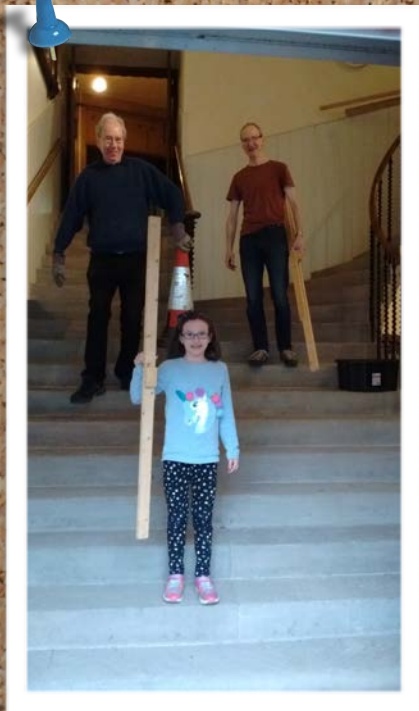
Volunteers working hard on the BVC skip day to clear out the vestry, organ loft and more