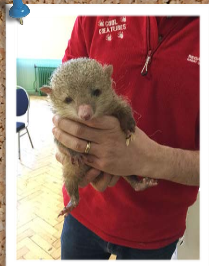
You never know who will visit the office – this is a tenrec!

Want to see your photo here? Email it to the address on p.13