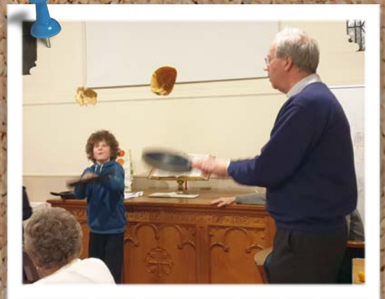
Watch out for the flying pancakes!