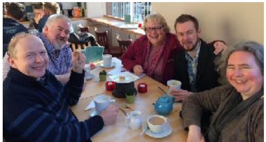
Farewell to the Famous Five