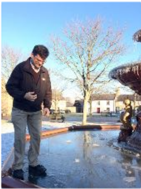
Not only Jesus can walk on water...