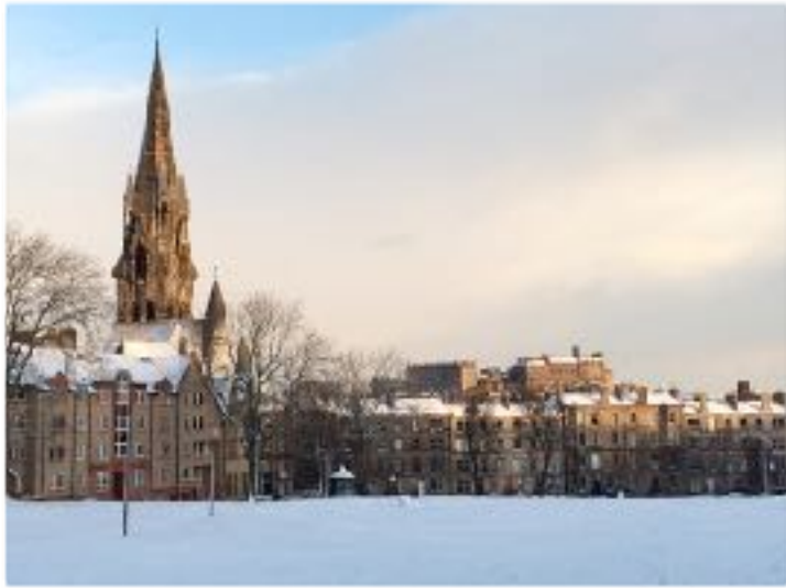
Barclay Viewforth in Winter Snow