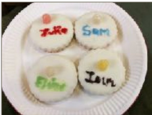
An Imperial Tradition