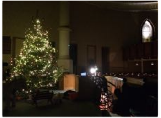
Christmas by Tree Lights