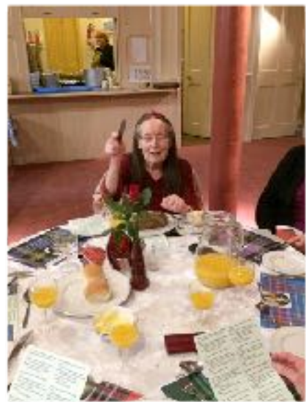
“great chieftain o’ the puddin’ race”