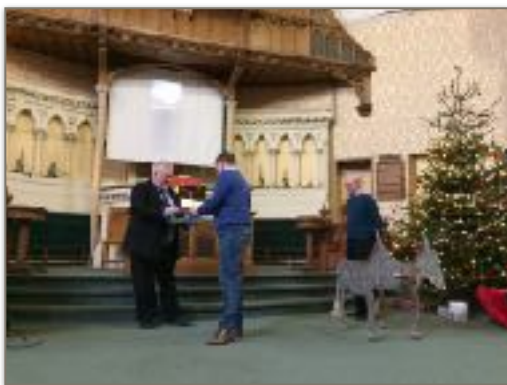
Sharing our thanks