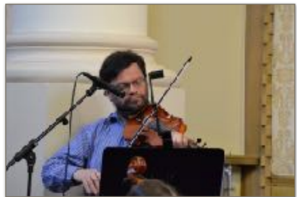
Moray's musical tribute