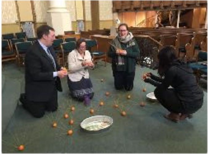
Rebuilding fragile oranges before the service