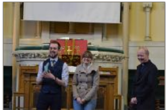
Gifts of appreciation