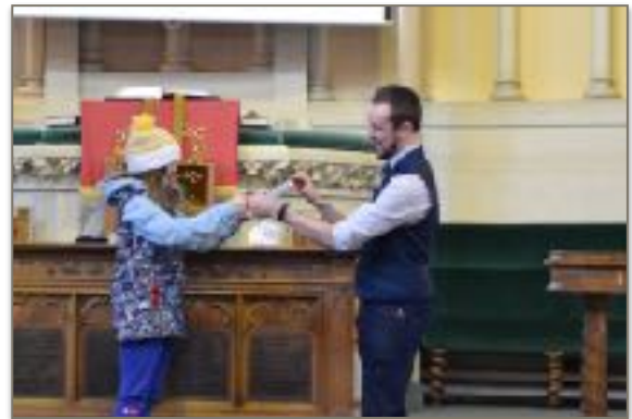
Do you have prayer power?