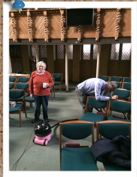
Thanks to all the "holy dusters" for cleaning the church

Want to see your photo here? Email it to the address on p.13