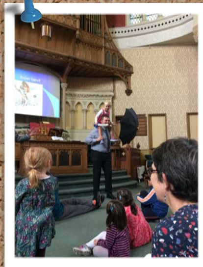
Goliath walks again!