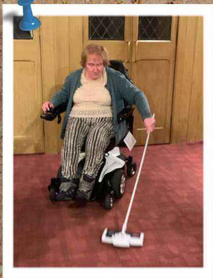
Nothing is impossible!