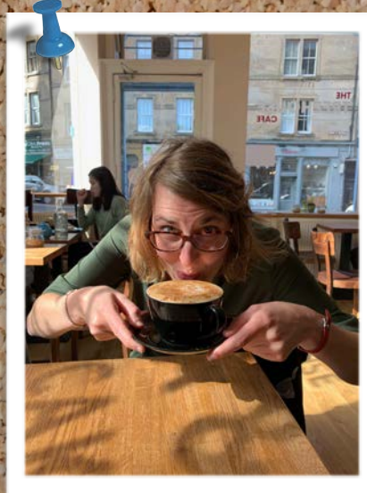
First pumpkin spice latte of the season

Want to see your photo here? Email it in!