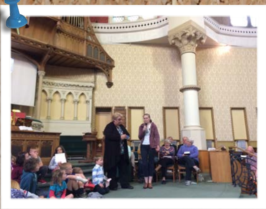
Goodbye to Heather!